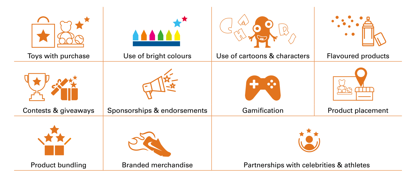
Panel 5. Marketing tactics targeting children

Given the multifaceted nature of marketing and its ability to create unhealthy environments, a package of complementary policies addressing each of these elements will have the greatest impact on protecting children and young people. Existing policies tend to address one facet or element of marketing harms and are fragmented from one another on domestic and international levels. It is increasingly important to align existing and new regulations with frameworks that provide evidence and models of implementation for effective regulation.